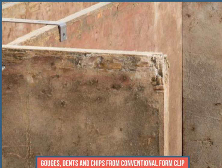
GOUGES, DENTS AND CHIPS FROM CONVENTIONAL FORM CLIP REMOVAL RUINS EXPENSIVE FORMS