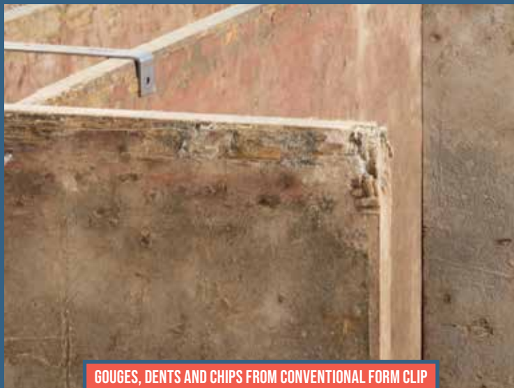
GOUGES, DENTS AND CHIPS FROM CONVENTIONAL FORM CLIP REMOVAL RUINS EXPENSIVE FORMS